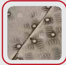
Aluminium Chequered Sheet