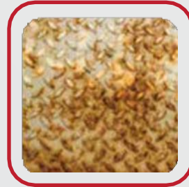
Mild Steel Chequered Sheet